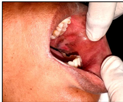
The above picture shows Erosive Lichen planus involving left buccal mucosa

On inspection, intraoral inspection was performed with proper cheek retraction. The hard and soft palate, floor of the mouth, tongue (dorsal, ventral, and lateral surfaces), labial mucosa, gingival tissues, and right buccal mucosa were within normal limits. A well-defined area of interlacing white striae (Wickham's striae) was observed on the left buccal mucosa. The lesions appeared as fine, lace-like, whitish-grey linear striations arranged in a reticular (net-like) pattern. The striae were bilateral and confluent in the mid-buccal zone, with no associated ulceration, erosion, or bullae formation.